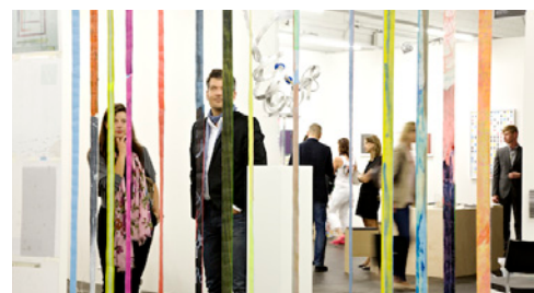
Visitors at VOLTA7 Basel 2011