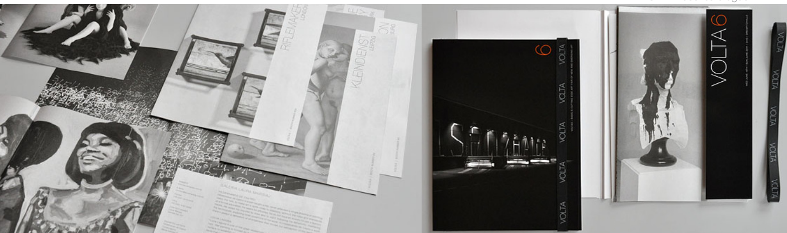
VOLTA Basel catalogue

Exhibitors have the opportunity to participate in and enjoy the accompanying VOLTA VIP program, which includes a specialized and dedicated communications plan to a database of 12,000 much sought after individuals, sneak previews and early access hours and complimentary tickets to Art Basel and the Liste Vernissage. Over a period of eight years, VOLTA has developed and refined its database to include an enviable coterie of loyal collectors, investors and VOLTA fans.