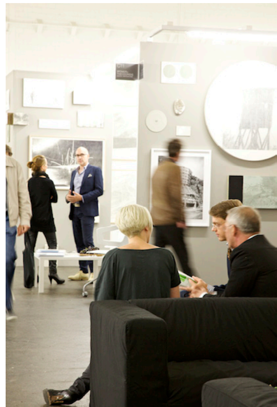
Seating area in front of Widmer + Theodoris' and Teapot's booth