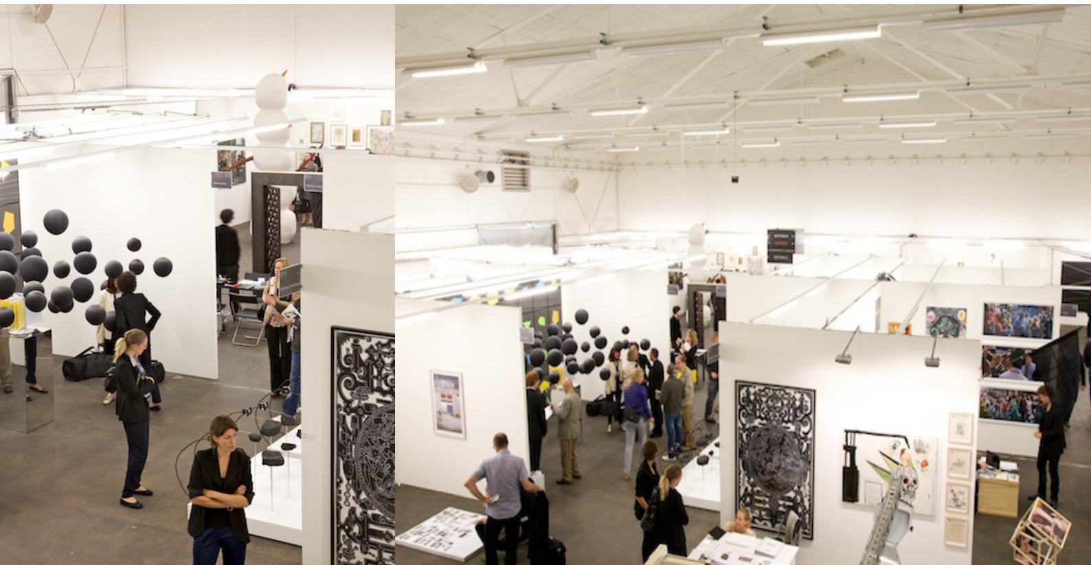
Overview of VOLTA6 2010 at Dreispitzhalle Basel

VOLTA is only 7 minutes from the main SBB train station by public transport or 5 minutes by car. With a 400-car public structure one block away, parking is trouble-free. In addition, regular complimentary VOLTA shuttles run directly from Art Basel and from Liste, so reaching the fair is effortless.